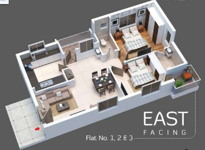
Typical Floor Plan AREA STATEMENT